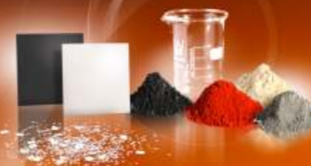
NTC THERMISTOR CERAMICS

Tewa products will be Restriction of Hazardous Substances Directive (RoHS). We are enhancing our process to offer you, our customer, products meeting the relevant quality and environmental standards.